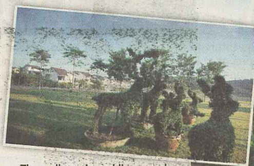
The well-manicured linear park with its topiary figurines.