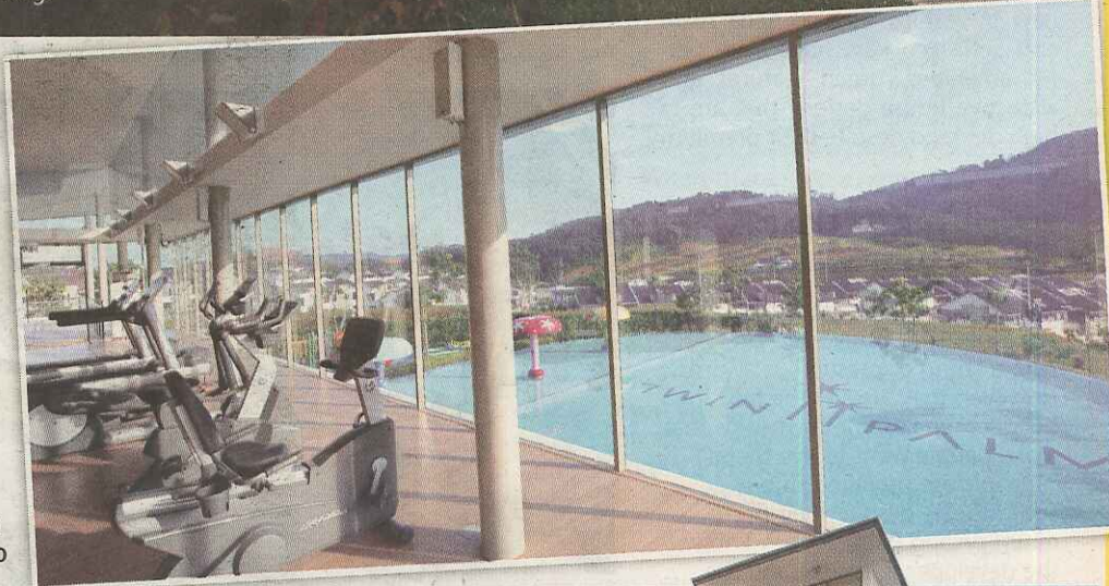
The gym in the Orinoco clubhouse.