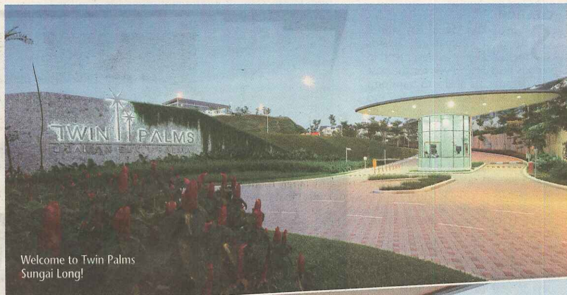
Welcome to Twin Palms Sungai Long!

Palmrya superlinks' Phase 1A, which have been completed and handed over to purchasers, were designed by design firm Atelier 8 that analysed the shortcomings of conventional terrace houses and created layouts inviting natural lighting and ventilation inside while enhancing visual linkages to create a more vibrant environment. The firm is also behind the much anticipated new semi-dee phase Maya slated for launch in Q1, 2011.