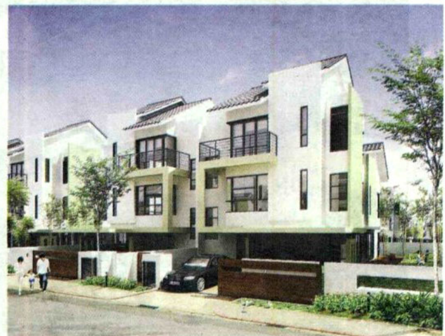
(From top) Areca Type A, Areca Type B and (left) the Palmyra superlink homes.

that retains much of the area's original topography of undulating hills and vales.