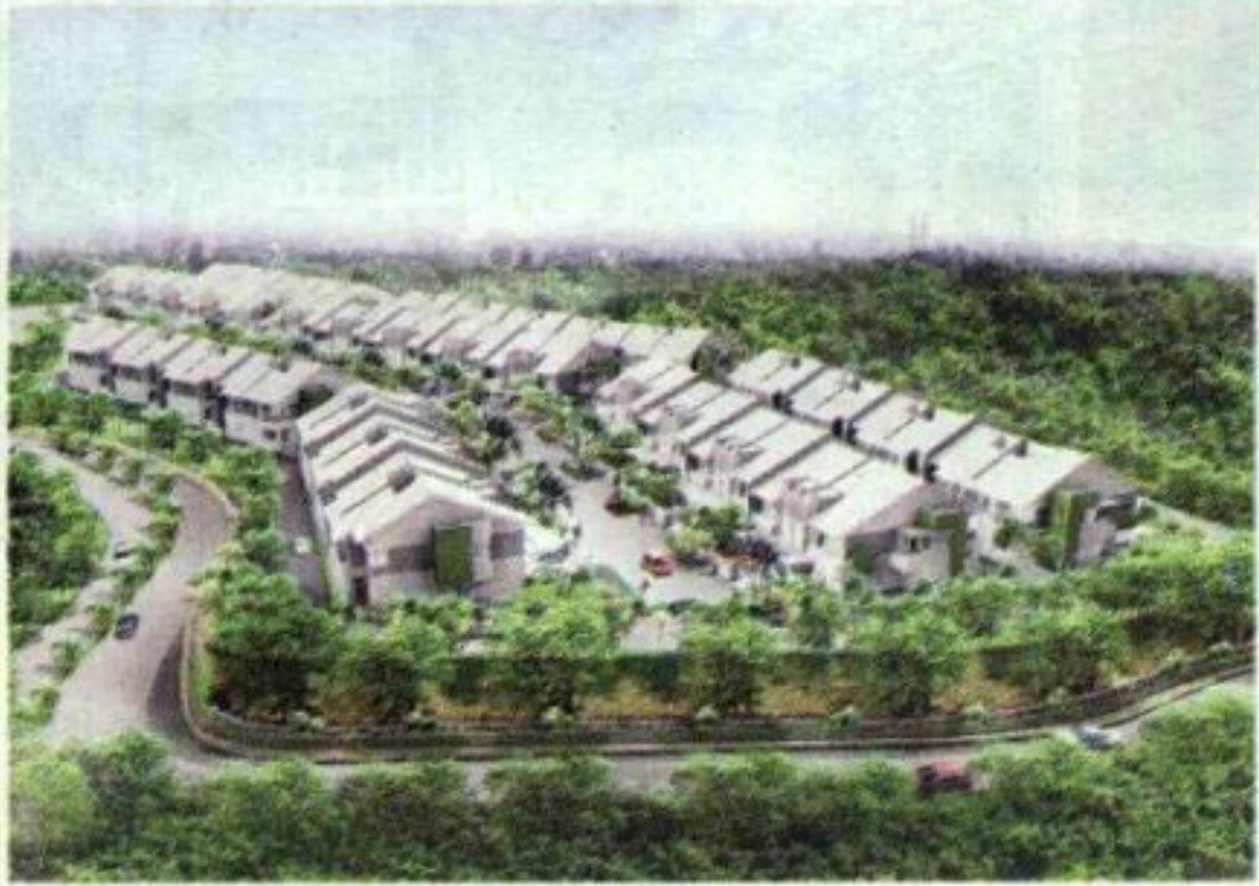
(Above) The Orinoco Clubhouse will have pools, Jacuzzi, gym and a multipurpose hall among other things. (Left) Twin Palms in whole.