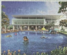
World-renowned architectural firm Eco ID designed the clubhouse to take care of the social and recreational desires of the residents.

Keeping things as natural as possible is Twin Palms' strategy to making it the next high-end residential spot of Cheras.